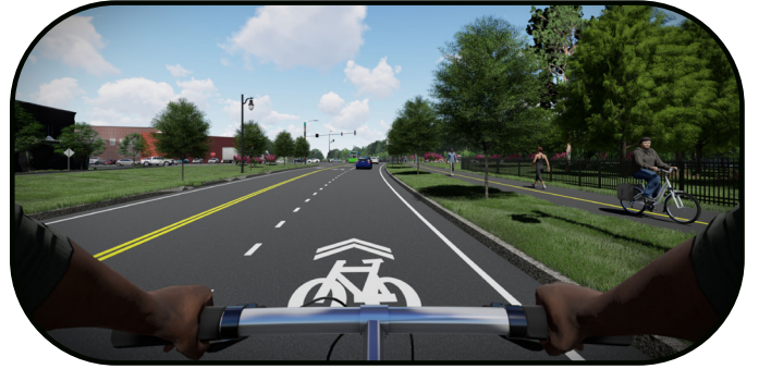
Waxaa jiri doona guryo ay wadaagaan baaskiillada wadada dhinaceeda ee mashruuca oo dhan.

Xaafadaha 'MAPLE iyo KING STREET, aan hagaagsaneen, kala go'an ', iyo wadooyinka yar ee ciriiriga ah ayaa lagu beddeli doonaa 5 -talaabo ADA - compliant. Wadooyinka cusub ee dadkalugeynaya waxay lahaan doonaan sagxad loogu talagalay fududeynta socodka dadka curyaamiinta ah iyo isgoysyo. Isgoys walba wuxuu lahaan doonaa wajiga WALK oo loogu talagalay calaamadaha taraafikada. Waxaa jiri doona shardiyo rinjiyeyaal keenaya dariiqyada baaskiillada wadada-koonfur ee deriska.