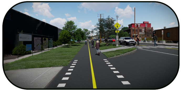
Wadada la wadaago ayaa la dheereyn doonaa Home Avenue ilaa Kilburn Street.