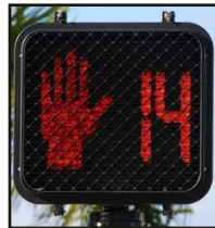
Calaamadaha gawaarida cusub iyo kuwa la casriyeeyay waxaa ka mid ah marxalad lugta goonni ah oo leh calaamadaha WALK, siinaya lugeeyayaasha waqti badbaado leh oo ay kaga gudbi karaan isgoyska.

Gudbi faallooyinka: Luuliyo 1o – agoosta 24, 2020