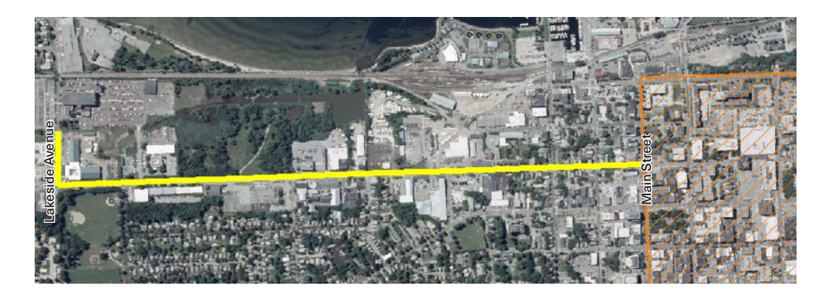
ON-ROAD AREA from Lakeside Avenue to Main Street, the Champlain Parkway will follow existing city streets.

In the MAPLE AND KING STREET NEIGHBORHOOD, traffic will flow more freely. New signals will be installed at the intersections of Pine Street with King Street and Maple Street. The existing signal at the intersection of Pine Street and Main Street will be upgraded. All signals will include an exclusive pedestrian WALK phase, transit signal priority, and emergency vehicle preemption.