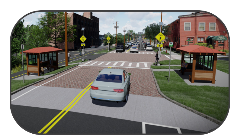
The Champlain Parkway will include new bus shelters to improve transit riders' experience.

The Champlain Parkway will improve transit access within the study area. New bus shelters will improve the safety and comfort of riders. All new and updated traffic signals will include transit signal priority which allows buses to move through the area without waiting at traffic lights.