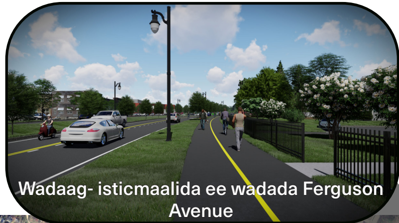
Wadaag- isticmaalida ee wadada Ferguson Avenue