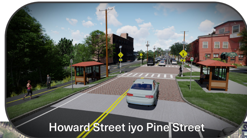
Howard Street iyo Pine Street