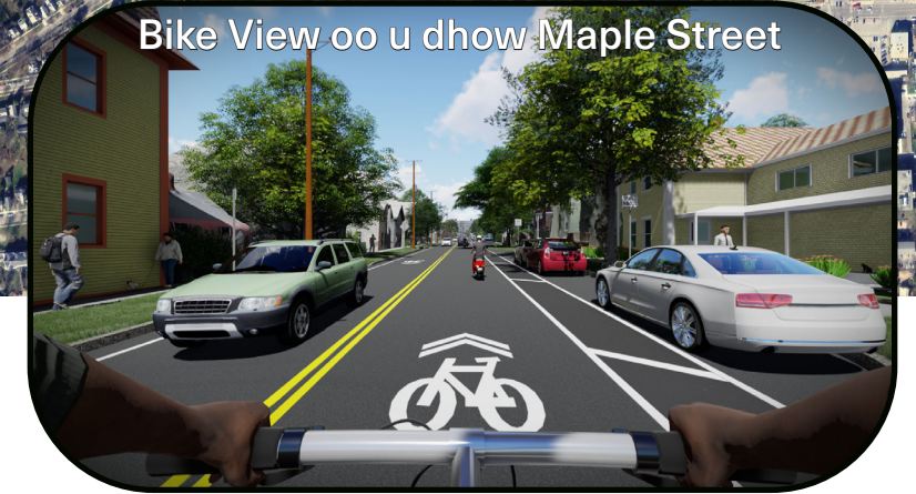
Bike View oo u dhow Maple Street

Champlain Parkway waxay isbedel kusmayn doontaa isticmaalka inta u dhexeysa I-189 / U.S. Route 7 interchange ilaa Xarunta Degmada Burlington ee Bartamaha iyo aagga hore ee biyaha ku yaal magaalada hoose; waxay hegaajini wareega, dhaqdhaqaaqa iyo amniga dariiqyada degmada, waxay siini cawwimaad dhanka taraafigada koonfirta Burlington, waxay caqabada ka saari deegaanka deriska ah; waxay kala saari dadka maxalliga ah iyo TARAAFIGADA ; waxayna taraafigada tracktada ka yareyni wadooyinka isku xiraan dadka maxalliga ah.