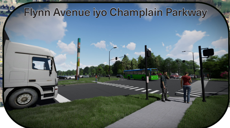
Flynn Avenue iyo Champlain Parkway