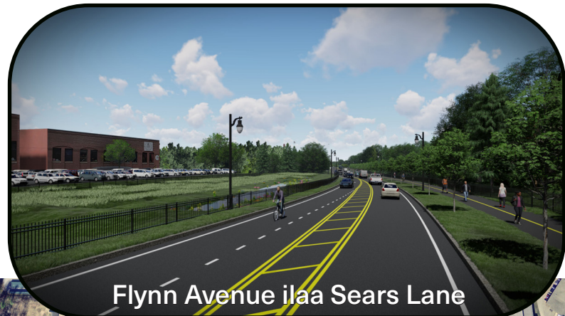
Flynn Avenue ilaa Sears Lane