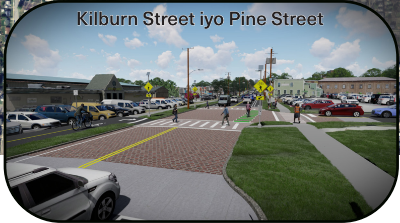
Kilburn Street iyo Pine Street